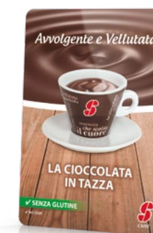
Chocolate display board