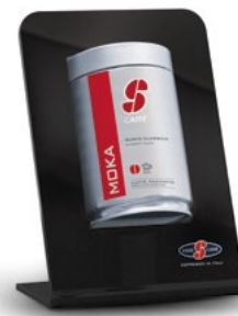
Plexiglass display for tins